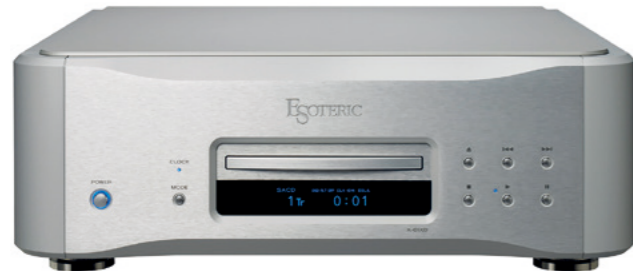
K-01XD Super Audio CD/CD Player

Finally, the K-01 series sublimates with a new VRDS “ATLAS 01” mechanism inherited from Grandioso, and full in-house designed “Master Sound Discrete DAC”.