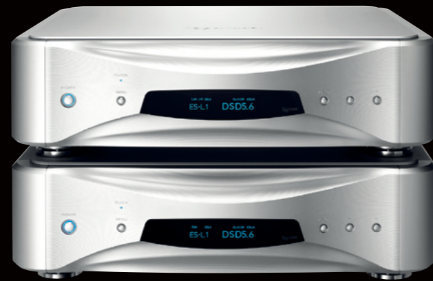
Sold in stereo configuration as shown.