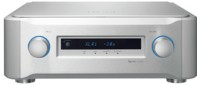
C-03Xs Stereo Linestage Preamplifier

A dual mono preamplifier that inherits the idea of C-02X. Accommodating three built-in power transformers.