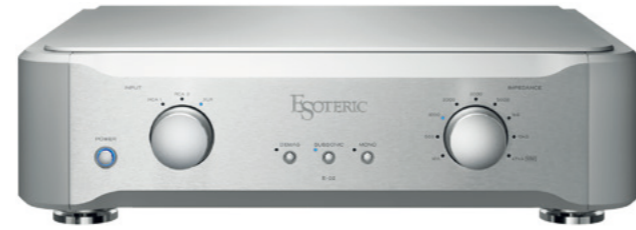
E-02 Balanced Phonostage Amplifier

This MC/MM-compatible phono amplifier is an apex of vinyl playback. Especially, providing fully balanced transmission and amplification on all MC cartridges.