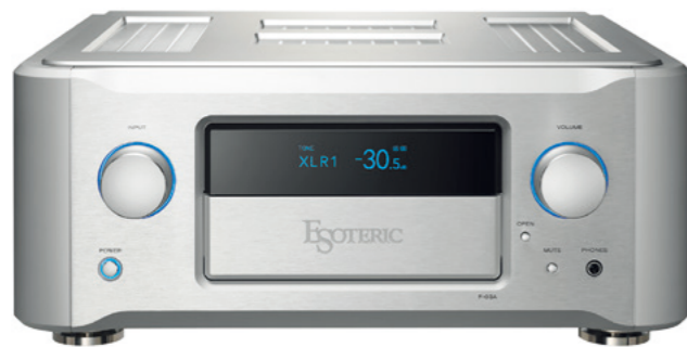
F-03A Integrated Amplifier

The basic style but completed. Equipped with a class-A amplifier and a fully balanced preamplifier direct descendant of the Grandioso.