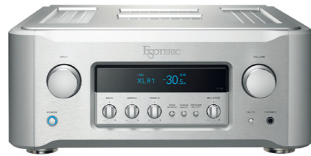
F-05 Integrated Amplifier

The basic style but completed. Equipped with a class-A amplifier and a fully balanced preamplifier direct descendant of the Grandioso.