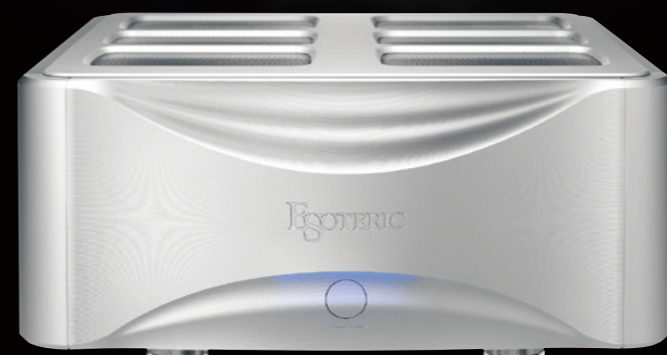
Grandioso M1X Monoblock Amplifier

Faithfully reproduce the dynamics of music. A monaural power amplifier gifted with a driving force that deserves for the flagship model.