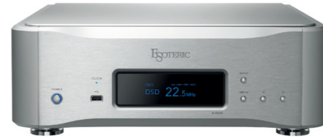
N-01XD Network DAC

A network transport unit that embodies the concept of separate components which is an invincible philosophy of ESOTERIC.