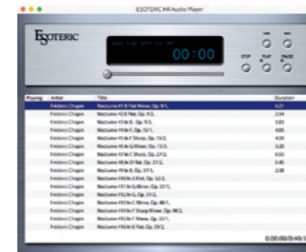
ESOTERIC HR Audio Player

Music Player Application (Complimentary)