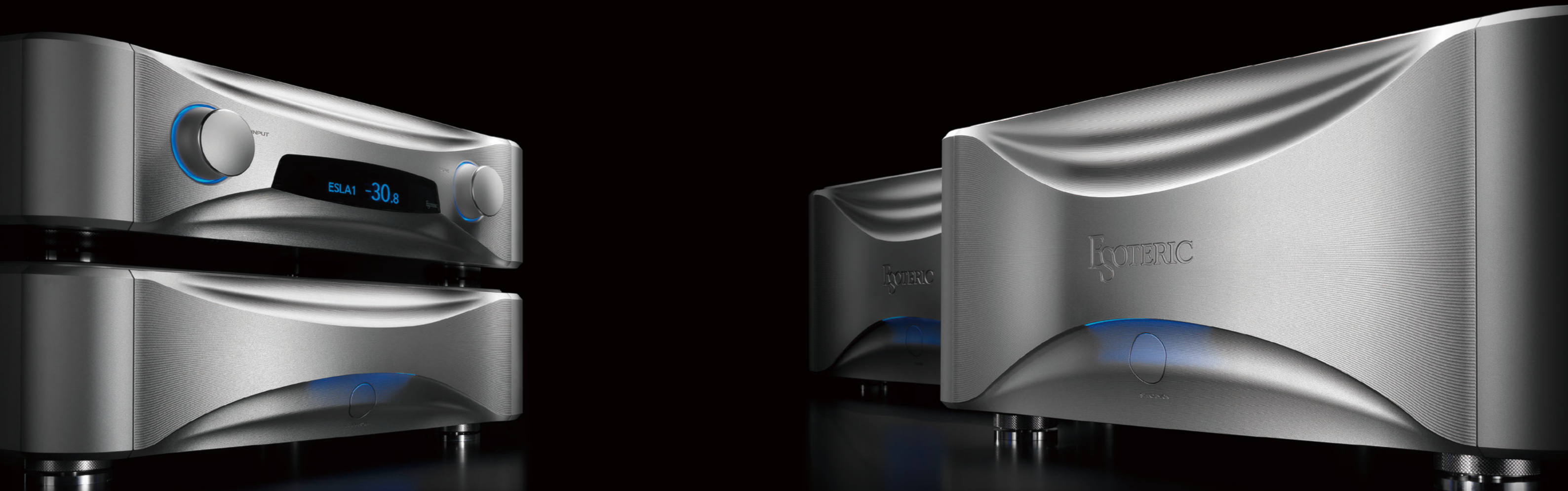
Grandioso C1X Linestage Preamp

An all new preamp employing ultra precise attenuator and integrated discrete amplifier modules that define new horizon of ESOTERIC amplifiers for new era.