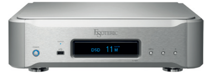
N-03T Network Audio Transport

Now supports ESOTERIC’s original digital transmission standard “ES-LINK”. Network audio player x DAC with rich DAC functions.