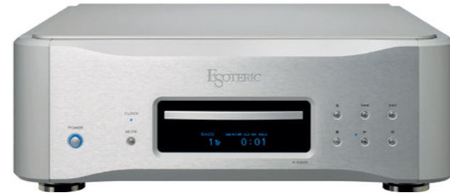
K-03XD Super Audio CD/CD Player

Eventually, the K-03 series acquires a new master VRDS “ATLAS 03” mechanism with a high degree of perfection, and full in-house designed “Master Sound Discrete DAC”.