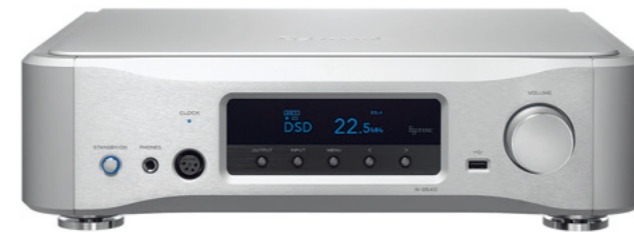
N-05XD Network DAC / Preamplifier

Reproducing the full sound quality of the original masters. The N-05XD represents a new frontier in network DAC/preamps that matches with ESOTERIC power amplifiers.