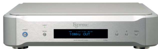
G-02X Master Clock Generator

Accommodating a newly designed OCXO clock that inherits G1 technology supporting various clock formats.