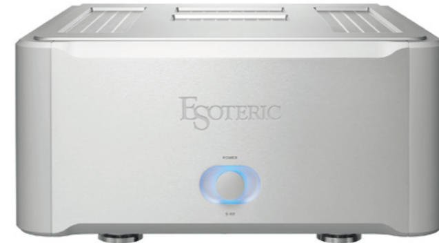
S-02 Stereo Power Amplifier

With overwhelming amounts of material, including powerful power supply section. A stereo power amplifier that inherits the idea of Grandioso.